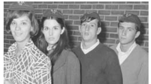
Beanies were de rigueur for Suffolk freshmen through the 1970s.

The exhibit will be at the Adams Gallery from Sept. 21 through Dec. 15, 2006. ▶